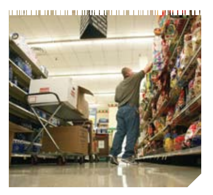
WITH A DIRECT LINK TO BACK-OFFICE MANAGEMENT SYSTEMS, EVEN ROUTINE PRICE CHECKING IS FASTER AND MORE ACCURATE