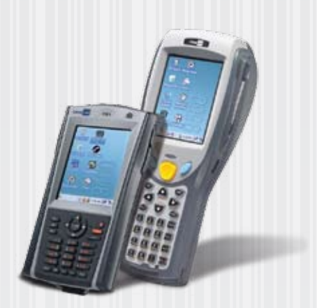
CipherLab 9400 and 9500 series