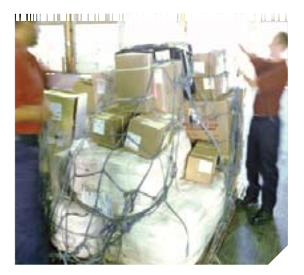
ANY FAST-PACED OPERATION WILL BENEFIT FROM INSTANTLY UPDATED DATA. WLAN BRINGS THE POWER TO EVERY WORKER